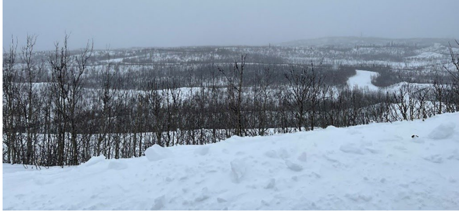
Figure 2. Ridgeline dominating DTA during JPMRC 22-02.

The Stryker's ability to sustain itself by carrying multiple days of supply benefited echelons at all levels. Platoons deployed with three to five days of supply (DoS) of Class I, Class III and Class V and could rapidly relocate to a sustainment node and refit for several days of combat. The squadron failed on one aspect of sustainability when it conducted a refuel-on-the-move after its initial tactical roadmarch. A single plowed road became a parking lot as convoy serials attempted to position themselves in line for the fueler. Completion of refueling operations were not complete until 48 hours later due to the traffic jam. In these situations, the squadron doesn't just rely on fuel to maneuver but also to maintain critical life-support functions to keep Soldiers warm.