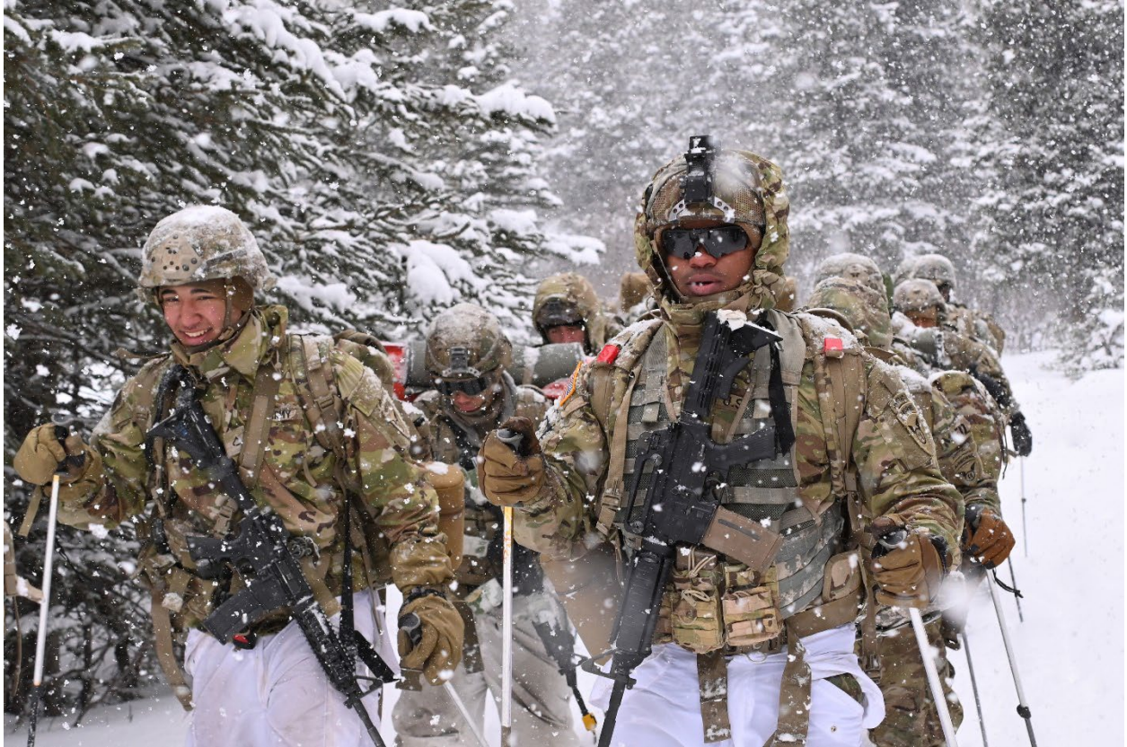
Cold Weather Leaders Course students move through the rugged terrain at the Northern Warfare Training Center's (NWTC) Black Rapids Training Site, AK, during a snowstorm in March 2023. NWTC cadre worked overtime to help meet the increased need for more Arctic experts in the units to help pass critical knowledge throughout the formations.